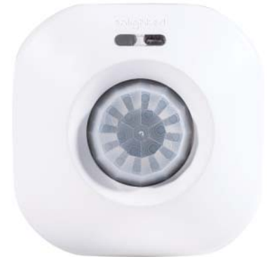
The Enlighted Smart Sensor

Lighting Technology Compatibility. The Enlighted Smart Sensor can send dimming controls to standard 0-10V ballasts and drivers for LED, fluorescent, HID, induction, or plasma fixtures and on/off controls for all types of fixtures and relays.