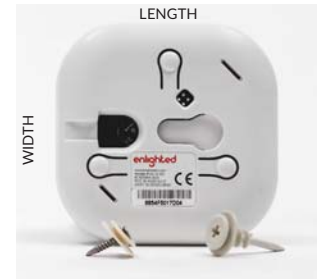
The Enlighted Smart Sensor